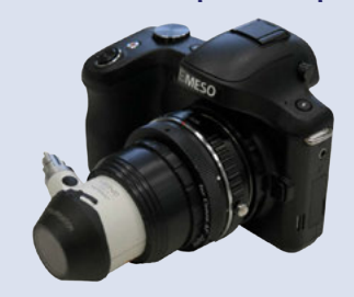
DICOM Camera for use in dermatology