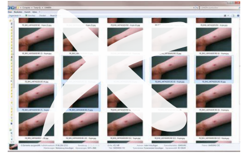
Eliminate manual mapping of pictures to patients!