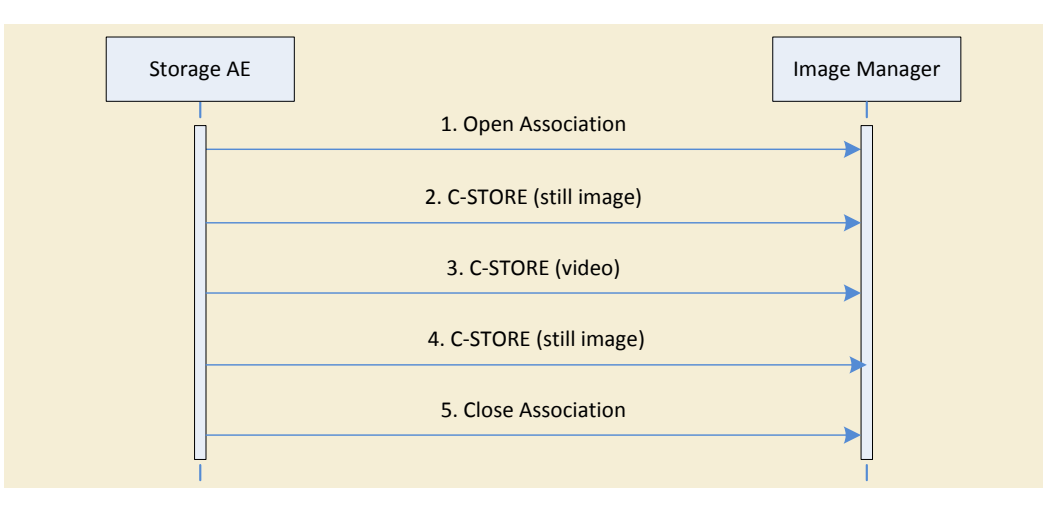
Figure 3-3 Sequencing of Activity – Send Images

The Storage AE attempts to initiate a new Association in order to issue a C-STORE request. If the job contains multiple images then multiple C-STORE requests will be issued over the same Association.